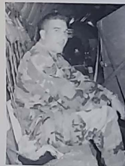
SSgt. T. deploys to join fellow 507th security forces members called-up to active duty. During the flight, an aerial refueling of three B-1B bombers was conducted.