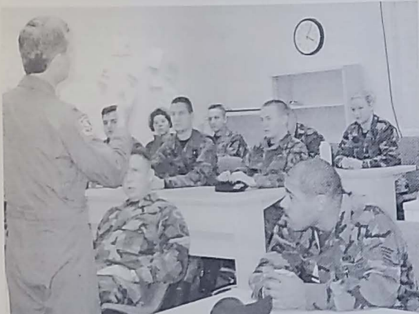
Col. Tim Wright, 507th ARW commander, addresses deployed members of the 507th Security Forces Squadron who have been on active duty in support of Operation Noble Eagle since Sept. 22.